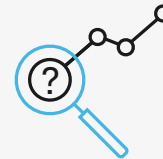
BLINDED DATA ANALYTICS