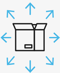
FORECASTING & PLANNING