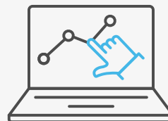
ELECTRONIC CLINICIAN RATINGS